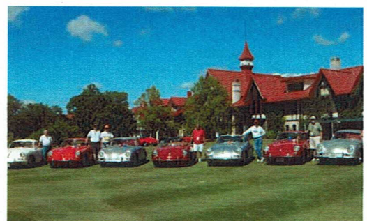
Above left is a group of "A" coupes with two from our club. Above right is a group of club members' cars that were around after the concours.