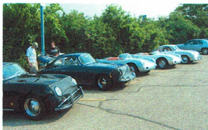
Photo above shows a few Cincinnati-area members who met and caravanned to Kettering together.

I'm sure the Taj website, www.tajmagaraj.com , will be updated soon with a complete list of award-winners and photographs from the event.