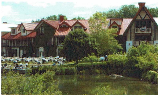
Below is a picture of many of the Convertible "D"s at the show.

Saturday was the Peoples Choice Concours including a special lunch on the grounds.